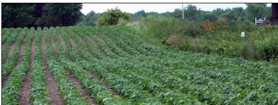
Trap near bean field

Western bean cutworm (WBC) is pest of both dry beans and corn. In the early 2000s, WBC expanded its range east into the Midwest. Larval feeding was first reported in commercial dry bean fields in mid-Michigan in 2008. WBC caterpillars chew into pods and damage beans. Feeding can directly reduce yield, but more importantly, damaged beans may be difficult to separate from whole beans. Thus WBC causes additional economic loss through the extra handling time required to separate the extra pick from marketable yield.